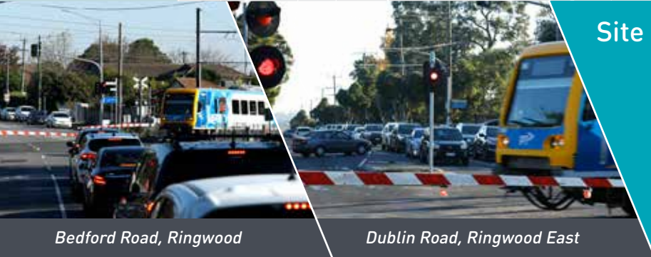
Bedford Road, Ringwood