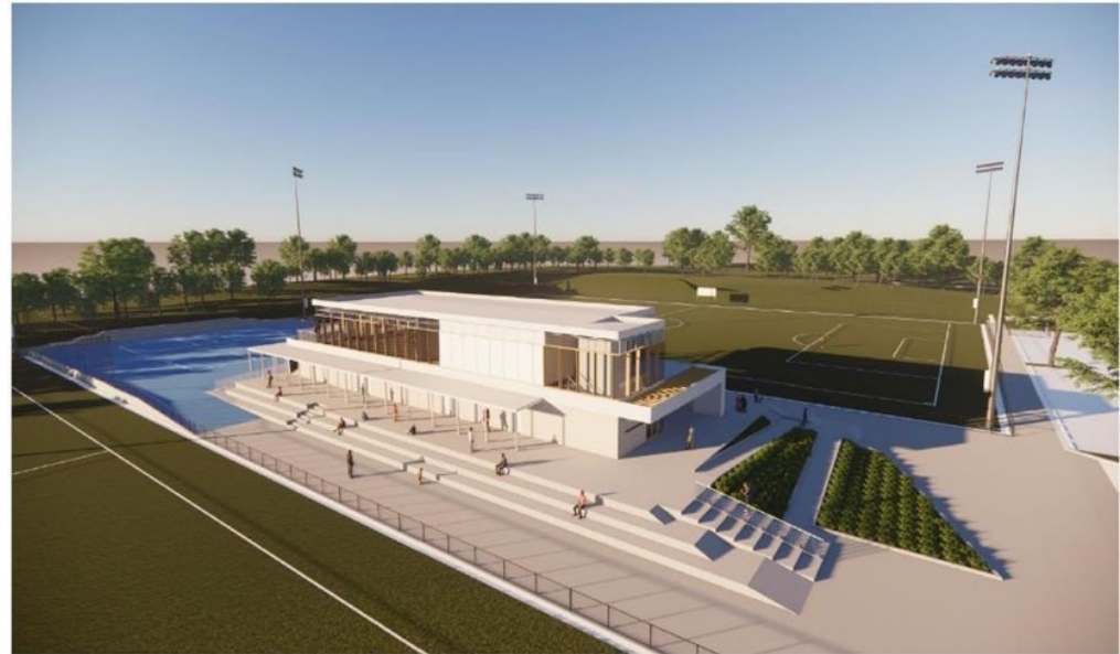
PERSPECTIVE VIEW 02: SOUTH WEST