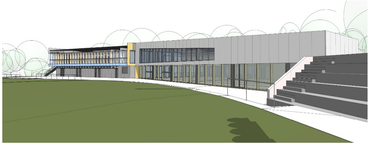
View from training entry