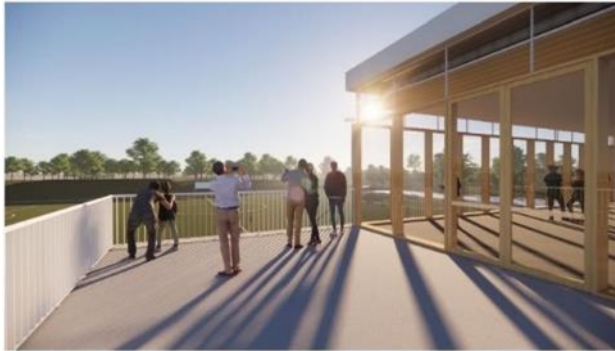
PERSPECTIVE VIEW 01: SPECTATOR DECK